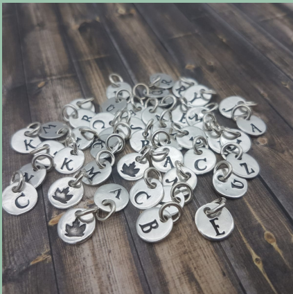
■ Initial Dot ~ $25 each *Please specify the initial