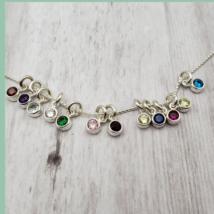
■ Birth Stone ~ $15 each *Please specify the month